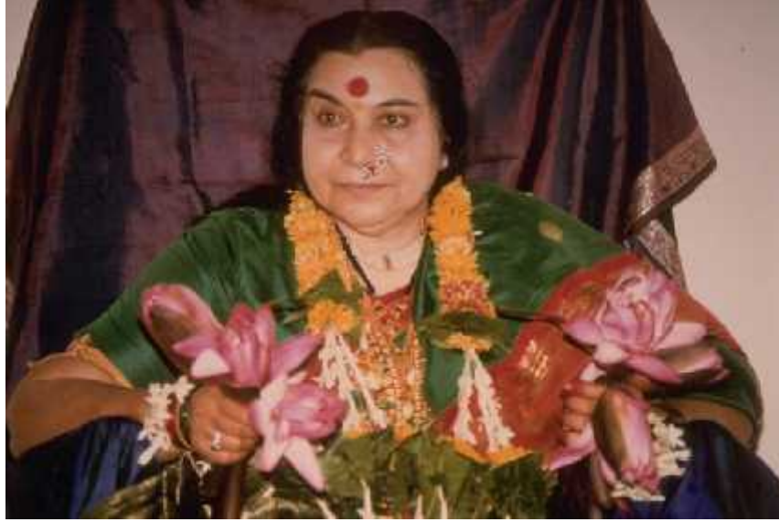
H.H. SHRI MATAJI NIRMALA DEVI

I welcome all of you from abroad, and this Kolhapur is regarded as one of the deities' temple, which have three-and-a-half deities, or you can say three-and-a-half coils of the Kundalini, so it is said that, in this triangular bone of Maharashtra – because it is surrounded by, on all three sides by mountains, and the plateau is in the center so the all the three sides make a nice triangle – is the Kundalini of the whole universe, of the whole world, is expressed by Mother Earth in Maharashtra.