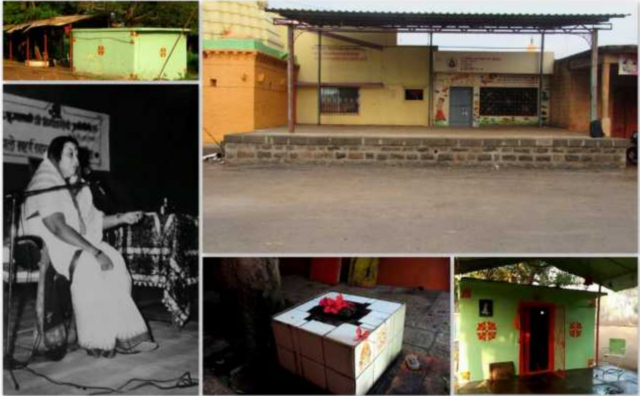
1). Side View of Shree Adiguru Dattatraya Temple. 2). Stage where Shree Mataji conducted Public Program in 1984. 3). Shree Mataji while giving mass self- realisation at Sadoli Khalsasa, Kolhapur. 4). Location inside temple where Shree Mataji meditated with visitor Sahajayogis. 5) Front View of Shree Adiguru Dattatraya Temple

H.H. Shri Mataji has blessed the holy land of Kolhapur with her lotus feet on many occasions. Many public programmes were conducted by the Mother in Kolhapur district such as Sadoli Khalsa, Jaisinghpur etc. Kolhapur has been blessed with Mahalaxmi Puja of Holy Mother in Sakar form in 1983, 1984 and 1990. Mother has also organised a Press Conference in Kolhapur in 1990. It's pertinent that, Mother has also guided the Sahajayogis about Sahaja Marriages in Kolhapur in 1987.